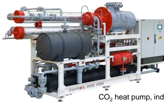
CO 2 heat pump, industry: 1000 kW